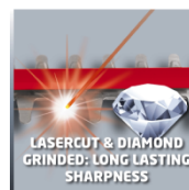
LASERCUT & DIAMOND GRINDED: LONG LASTING SHARPNESS