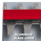
ALUMINIUM BLADE COVER