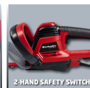
2-HAND SAFETY SWITCH