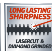
LONG LASTING SHARPNESS