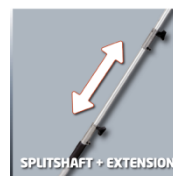
SPLITSHAFT + EXTENSION